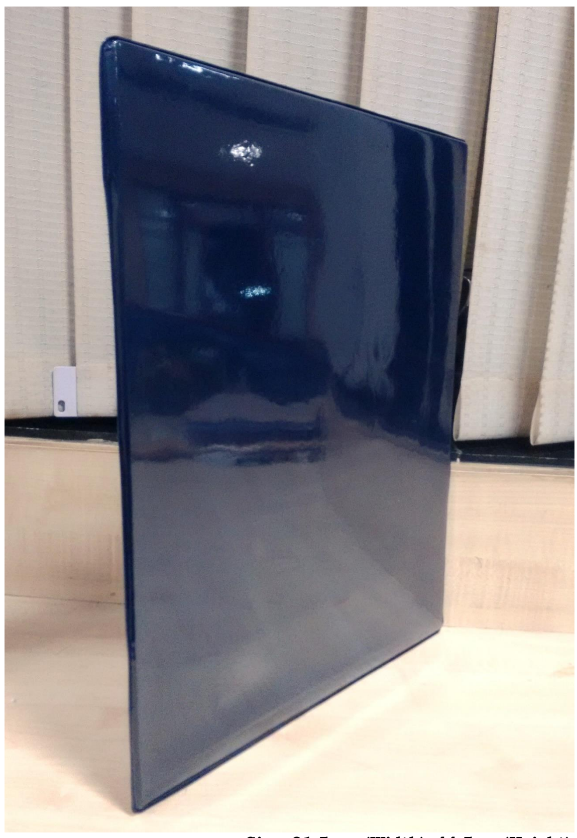
Size: 31.5 cm (Width), 44.5cm (Height)