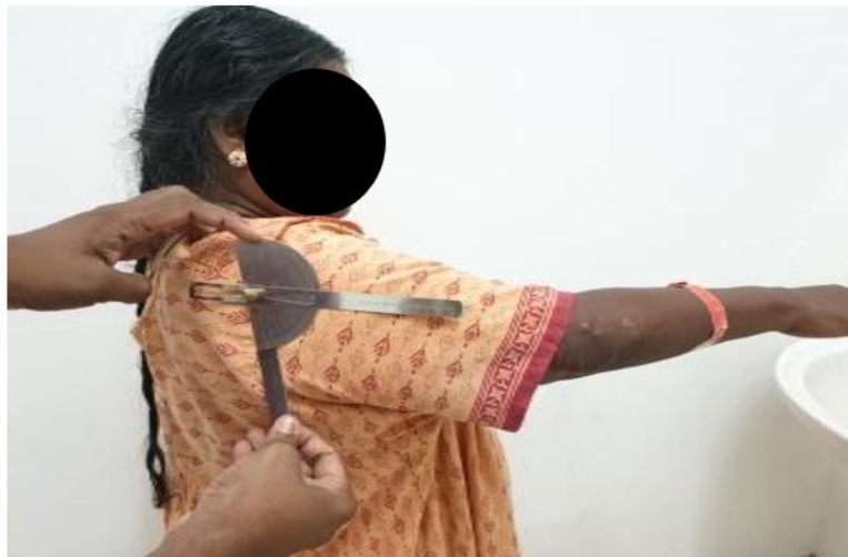
Figure 1. Measurement of Forward flexion

Abduction is measured in standing position using goniometer angle between arm and trunk noted (Figure 2).