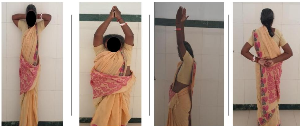
Figure 6: 1-month post-operative images (Representative)