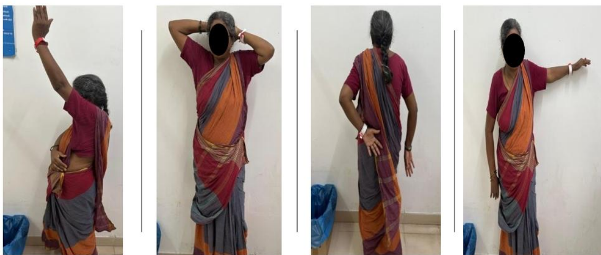
Figure 4. Pre-Operative images (Representative)

Figures 4-6 shows the Pre-operative, Intra-operative and 1 month Post-operative representative images.