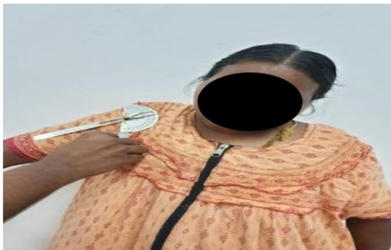
Figure 2. Measurement of Forward flexion